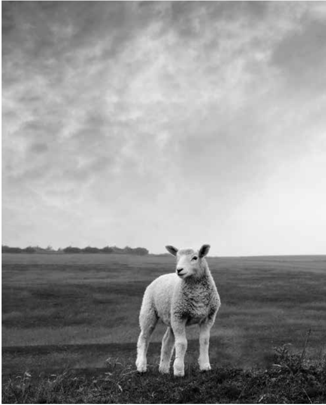
Sacrificing the unblemished lamb represented Jesus Christ's future sacrifice.