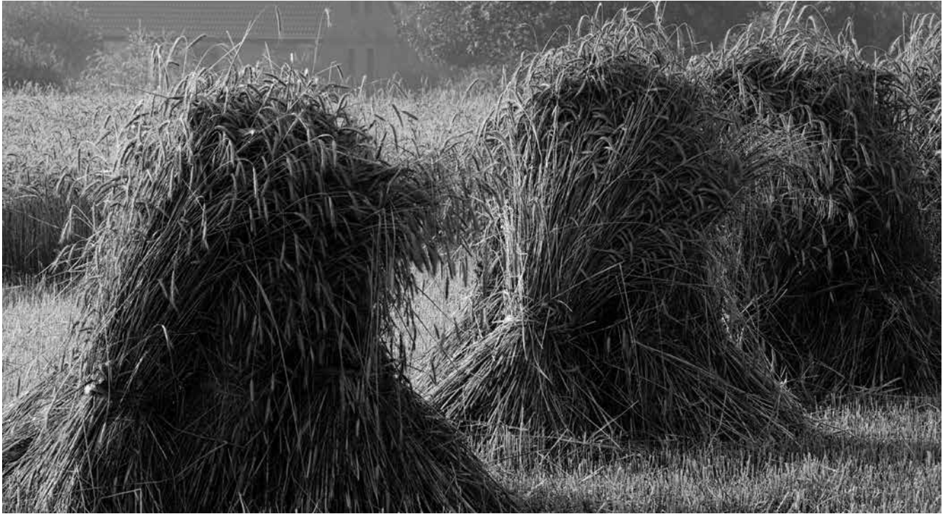
The wavesheaf offering represented the first of the firstfruits during the time of ancient Israel.

from our houses before the first day of Unleavened Bread. During this feast, He commands us to eat unleavened bread. This all reminds us to put sin out of our lives and to live God's way of life instead.